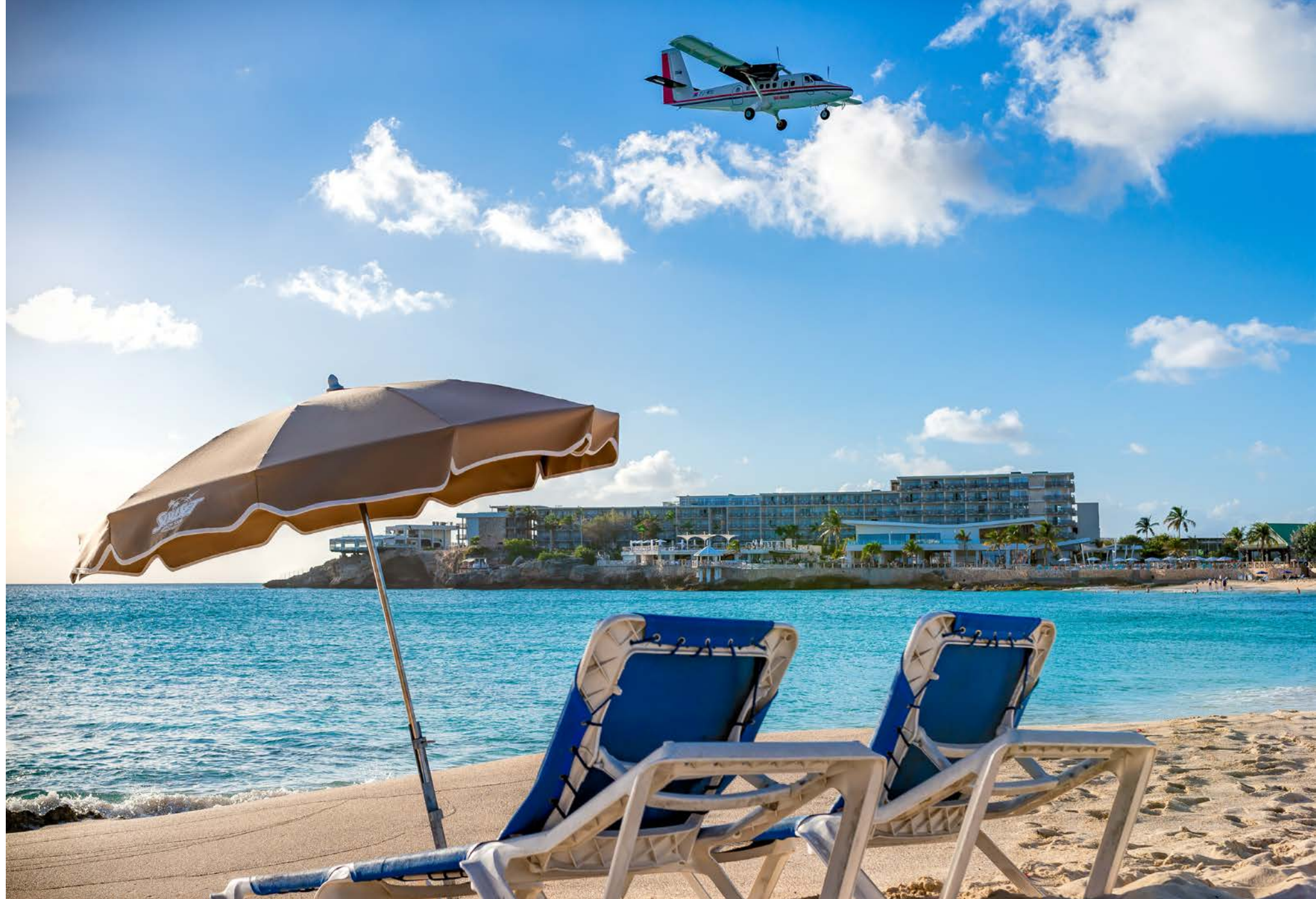
Winair flying over Maho beach, St. Maarten.