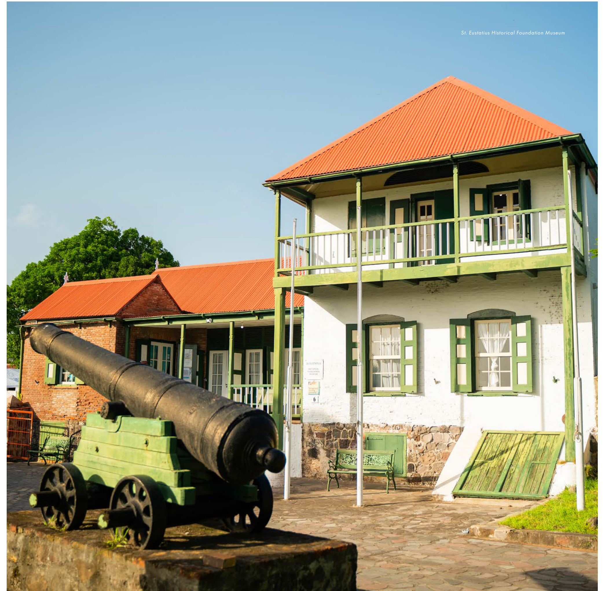
St. Eustatius Historical Foundation Museum

During the American War of Independence (1776-1781), St. Eustatius was crucial for supplying the Americans with guns and gunpowder. However, the British captured the island on February 3rd, 1781. They encountered little to no resistance due to a recent hurricane. The British occupation lasted three months before the French took control from the British. The island returned to Dutch control in 1784 and prosperity resumed until 1795, when it became French again, ending free trade. The population plummeted from 8,124 in 1790 to 2,668 by 1816.