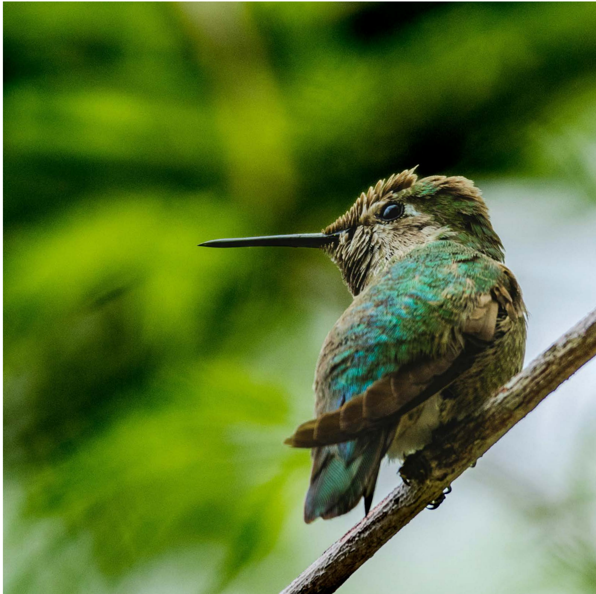
On Statia, the vibrant flora and diverse fauna weave a tapestry of life, where every leaf and creature tells a story of resilience and beauty.