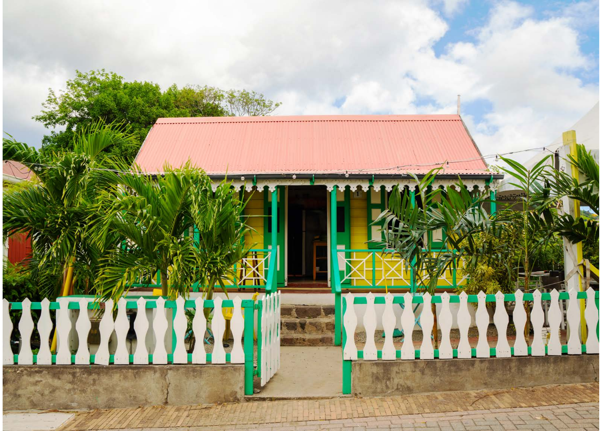
Typical colonial house of which many are still present and preserved in Oranjestad