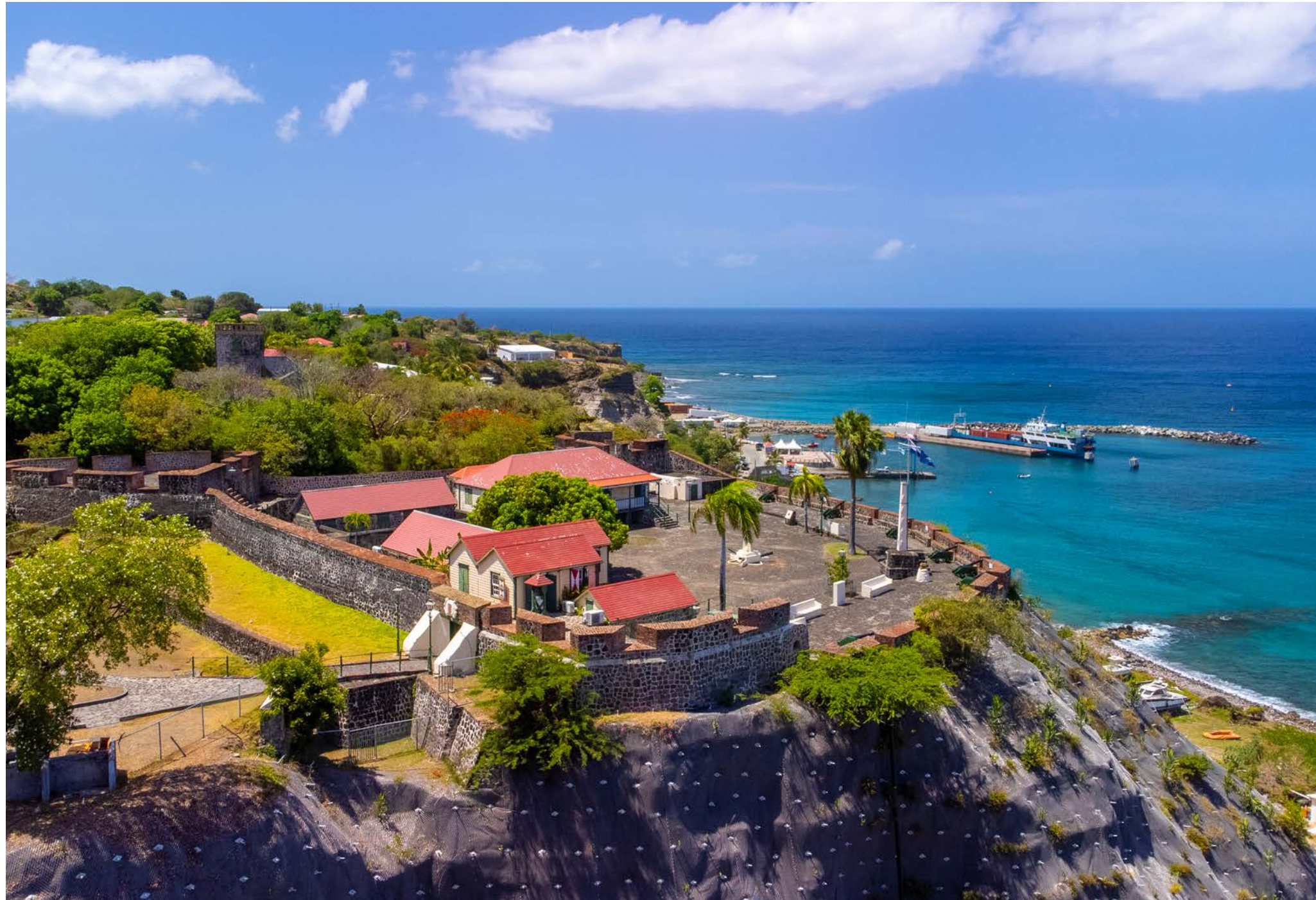
Fort Oranje is a fort with a courtyard and three bastions, built on the cliff face of Oranjestad. It is the most important and best preserved of the sixteen remaining defense works on the island.